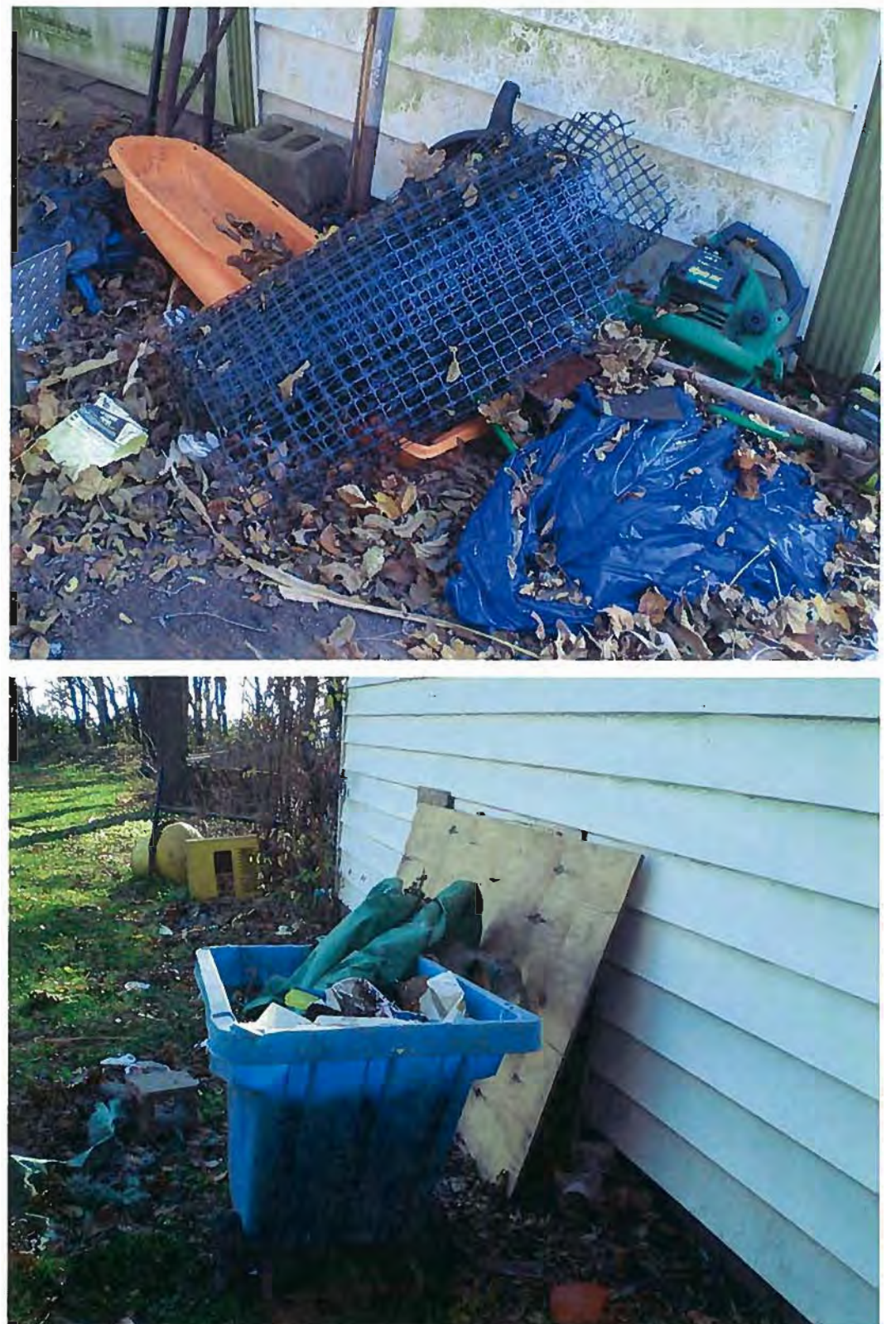
Date: 11/5/08 Time: 2:11 p.m. Direction: SW Exposure #: 009 Comments:

Fencing, tarp, chainsaw, sled pipes and block